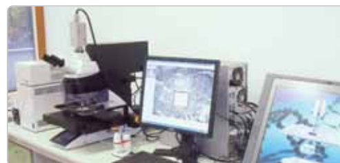
Laser Capture Microdissection system LMD7000, Leica (Transcriptomics and Proteomics Laboratory)