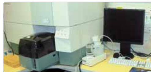
Flow cytometer FACSCalibur with sorting, Becton Dickinson (Laboratory of Virological Molecular Diagnostics)

The Biacore 3000 system for testing the intermolecular interactions in real time using changes in surface plasma resonance, GE Healthcare (Transcriptomics and Proteomics Laboratory)