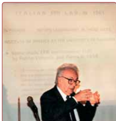
During the lecture