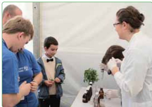
Science Festival 2009: lots of colours, lab equipment and parsley leaves – “same as your mom uses in the kitchen” – good recipe for invoking interest in science in the youngest generation