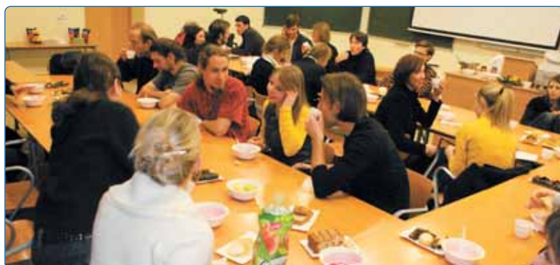
Mygen's Christmas meeting