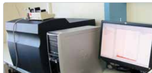
Mass spectrometer with ion trap ESI-HCTUltra, Bruker Daltonics (Transcriptomics and Proteomics Laboratory)