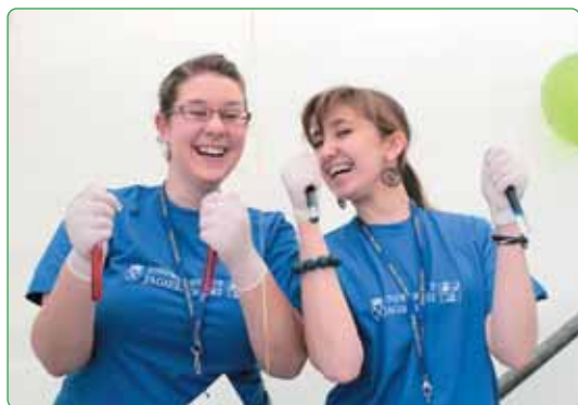
Science Festival 2009: Natural Obsession for Biophysics already Emanated from Labs...